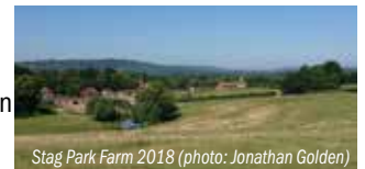
Stag Park Farm 2018