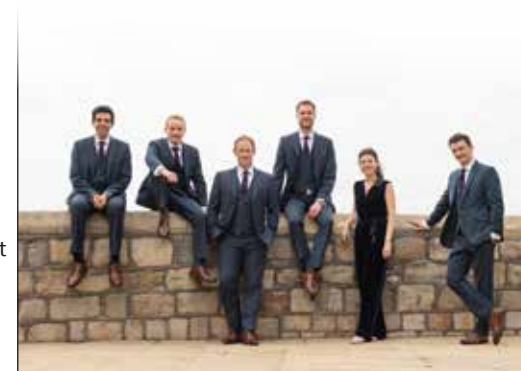
The Queen's Six

Based at Windsor Castle, members of The Queen's Six make up part of the Lay Clerks of St George's Chapel, whose homes lie within the castle walls. The chapel choir itself sings at the eight weekly services, as well as at private and state occasions – often before the Royal Family. Individually the members of the ensemble have performed with many of the country's most prestigious vocal ensembles but together they have honed an individual style and approach that sees them reaching beyond the repertoire of the choir stalls. Expect superb medieval chant, renaissance polyphony and madrigals – and also a sequence of more upbeat and contemporary arrangements.