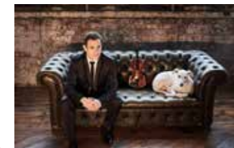
Jack Liebeck

Tickets: £32, £24, £14, £9 (18 and under £5, FREE in adult £9 seats)