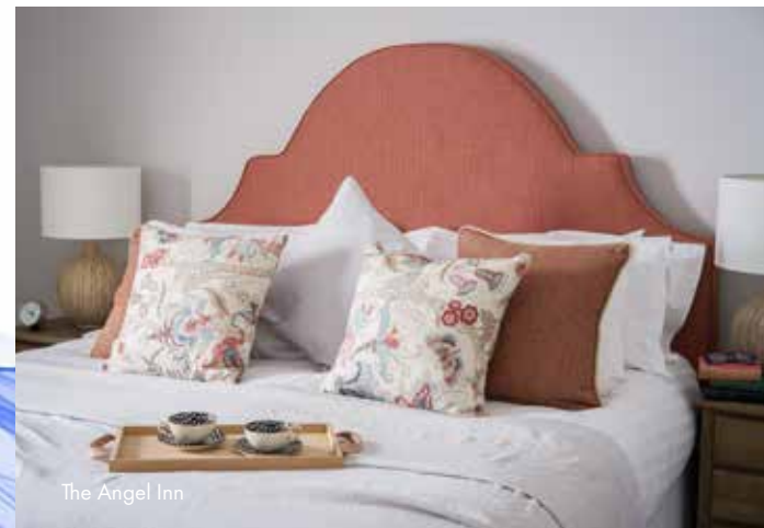
The Angel Inn