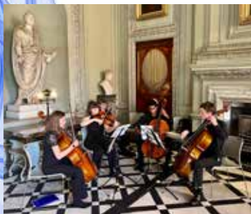
Young musicians from West Sussex Music

More than ever we also celebrate young and establishing talent. For the first time we welcome students from the Yehudi Menuhin School, and these extraordinary young people will take their place alongside fellow young musicians from Live Music Now (another of Yehudi Menuhin's legacies), the Royal Academy of Music, the Musicians' Company (formerly the Worshipful Company of Musicians) and West Sussex Music. We value these relationships enormously and pledge to continue building these relationships as a core part of the role of the festival.