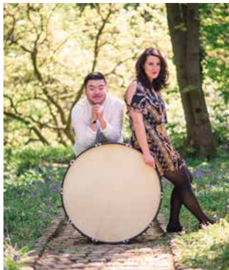
Aurora Percussion Duo

The duo's arrangements and classic percussion works - all dedicated to the forest - are segued by improvisatory compositions by Delia Stevens, exploring soundscapes such as music for seeds, leaves, paper and logs.